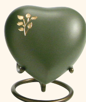
TREE OF LIFE HEART KEEPSAKE