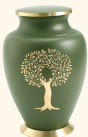
TREE OF LIFE URN